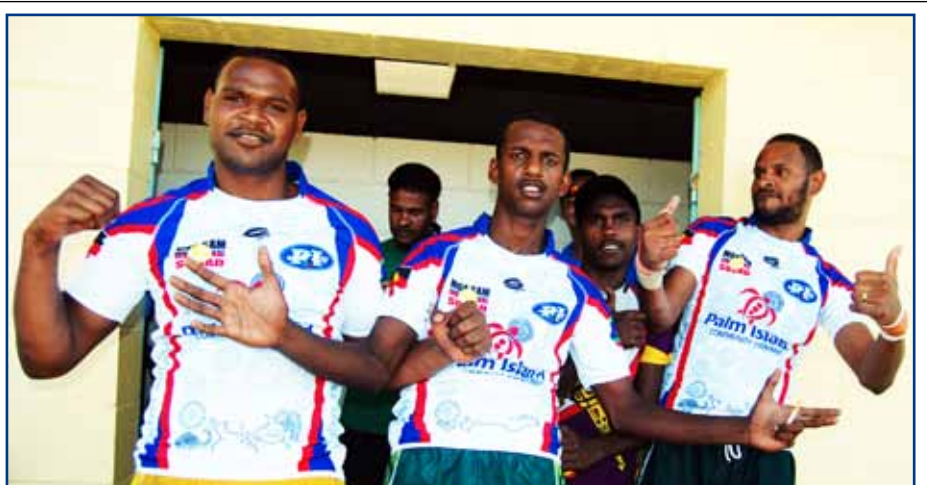
Jets players burst out of their training rooms in Cardwell last year